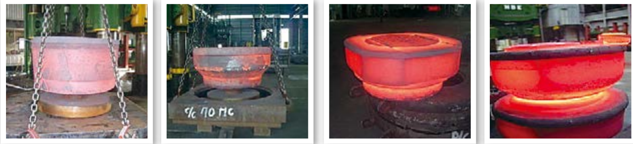
K98MC-C P/C S70MC-C C/C RTF-50 C/C RT96 C/C

Production scene of mold forging – Heating after mold forging scene