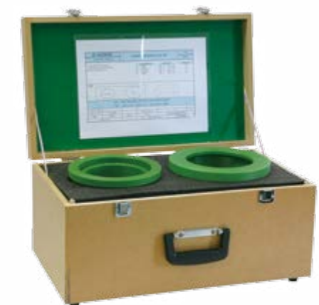
Mounting Tool (MAN B&W 26~98MC)