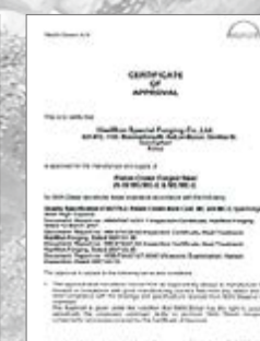
MAN P/C Letter of Approval