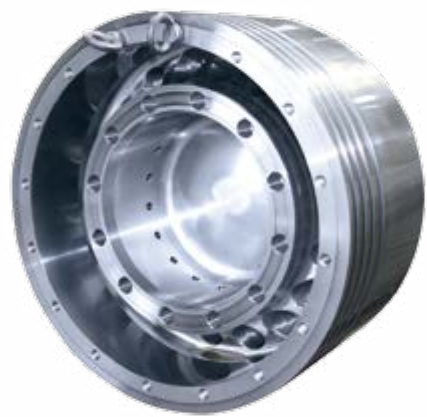
Piston in Stock