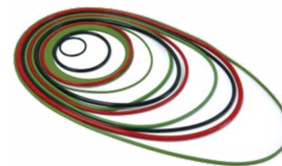
Sealing Ring & O-Ring (NBR, VITON, Silicon)