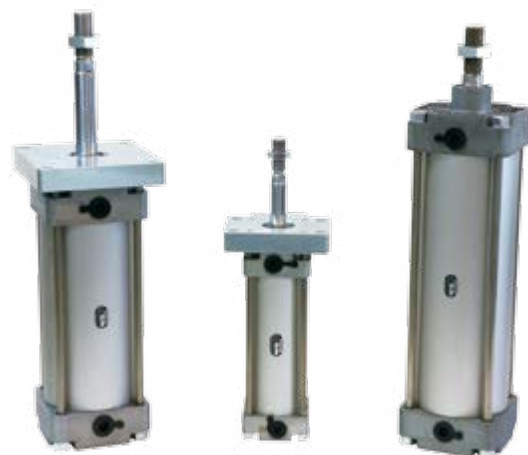
Air Cylinder (Reversing, Lifting, Linkage, Distributor)

Even Small Parts are Important-We can Help with These Too.